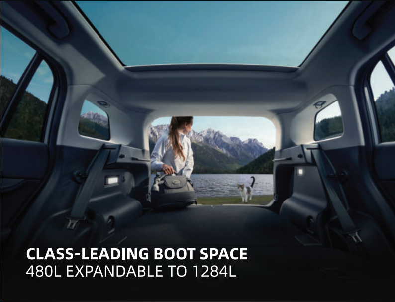
CLASS-LEADING BOOT SPACE 480L EXPANDABLE TO 1284L