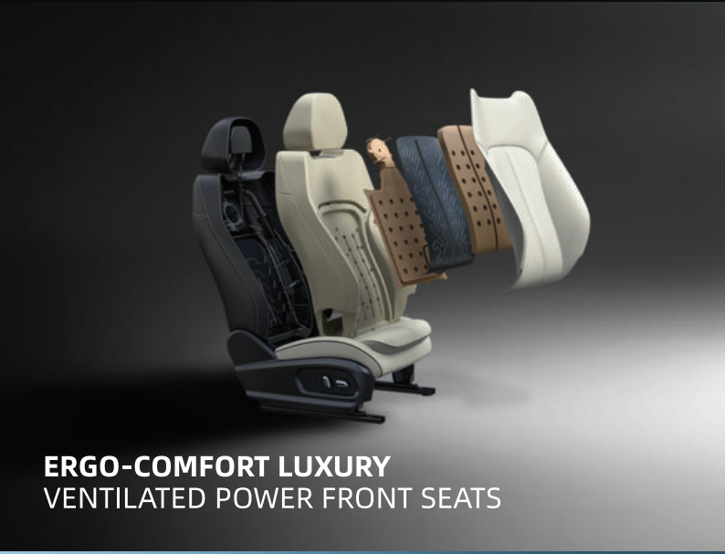
ERGO-COMFORT LUXURY VENTILATED POWER FRONT SEATS

Column-Mounted Gear Selector 8-Inch Digital Instrument Cluster 13.2-Inch 2K Central Touchscreen Display 50W Ventilated Wireless Charging Pad Multi-Function Steering Wheel With Cruise & Audio Controls Centre Armrest With Storage Interactive Multi-Colour Ambient Lighting