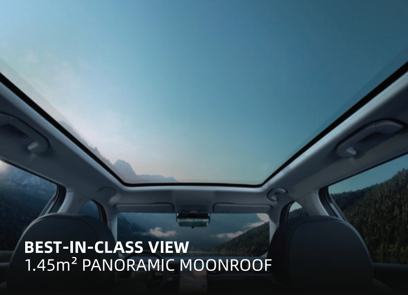
BEST-IN-CLASS VIEW 1.45m 2 PANORAMIC MOONROOF