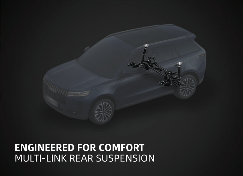
ENGINEERED FOR COMFORT MULTI-LINK REAR SUSPENSION